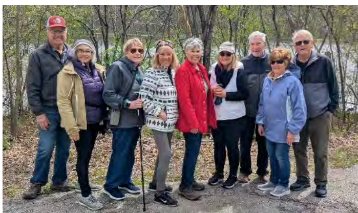
Scout Lake Park