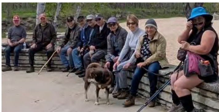
Vagabond hikers take a break near the lake at Menomonee Park.

June 25 – Village Park in Elm Grove: Located at 13600 Juneau Blvd., west of Legion Drive. Drive to the back of the park and park near the tennis courts. We will walk on paved surfaces.