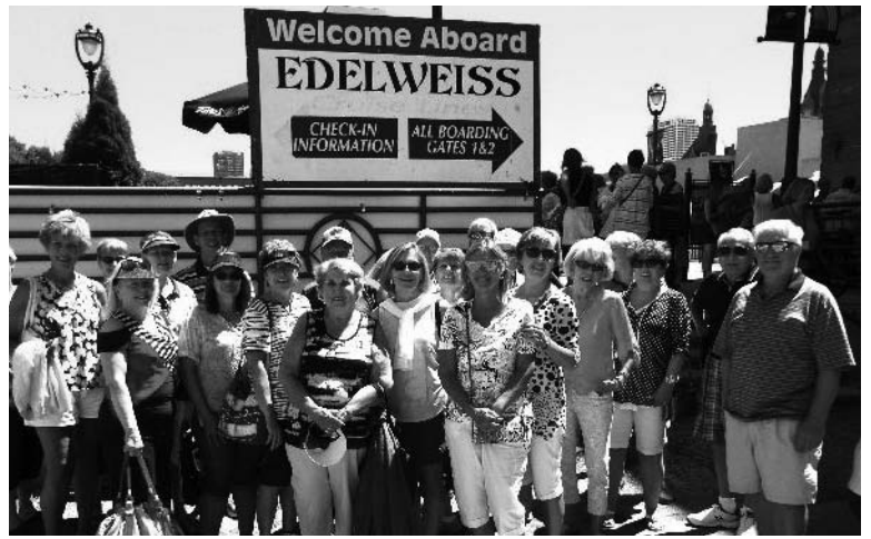
Vagabond members enjoy a day on the Milwaukee River boat tour learning some of the city's history.