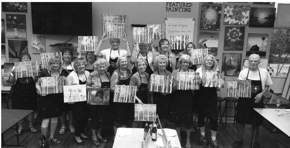
Vagabonds get creative with Wine and Painting!