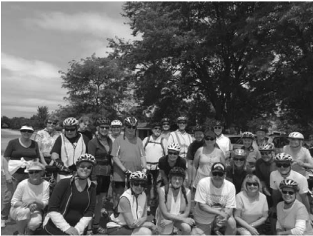
Biking in Brookfield was a blast.