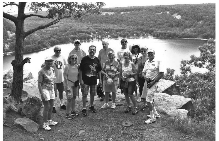
Gorgeous weather graced the Devil's Lake Hikers.