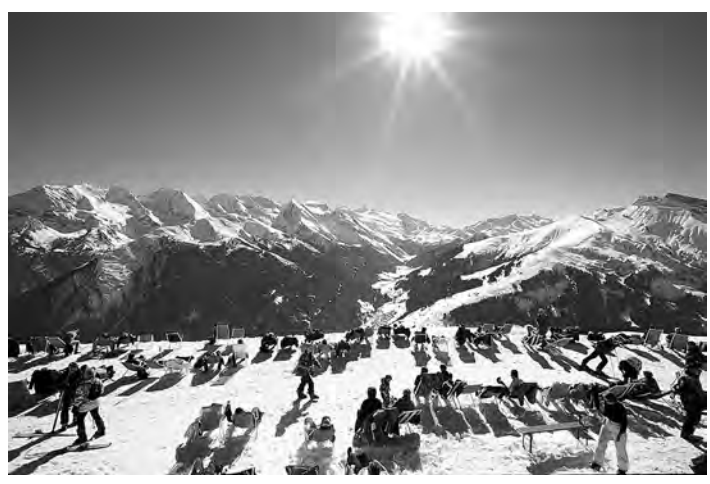
Upcoming ski trip sign-ups start ... July 1 – Breckenridge Aug. 1 – Park City

Details are being finalized for our February and March ski trips. The club will travel to Breckenridge , Colo. , Feb. 10-17 (Friday-Friday) and stay at the Village at Breckenridge Condominiums. This trip was canceled for February 2021 due to the pandemic.