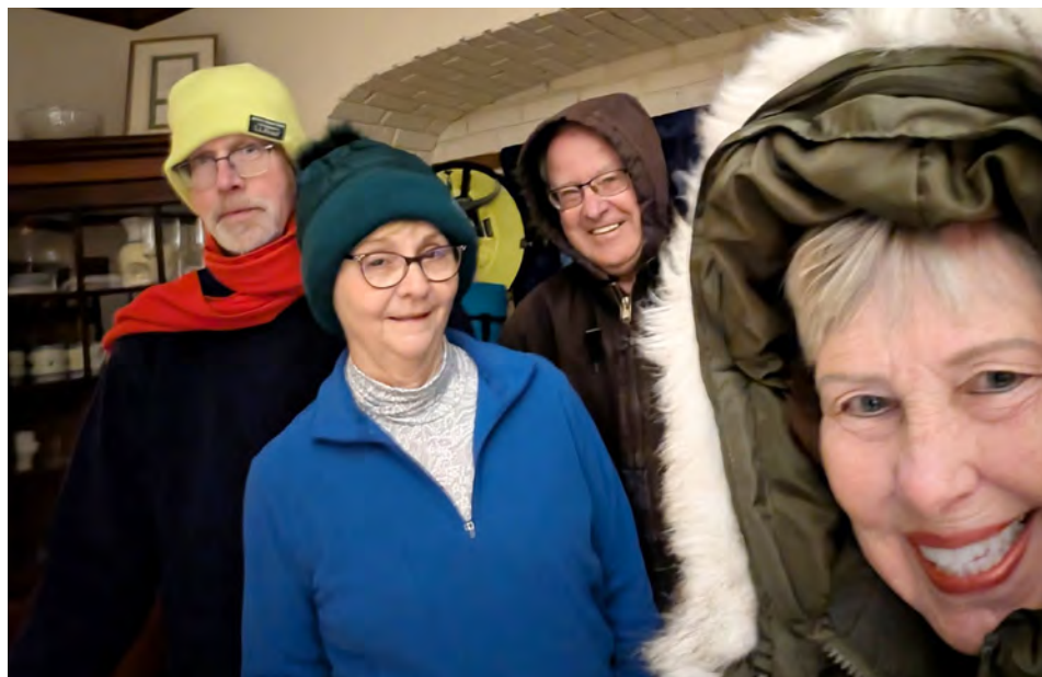
Milwaukee lakefront hikers. For the February hike schedule, see Page 4.