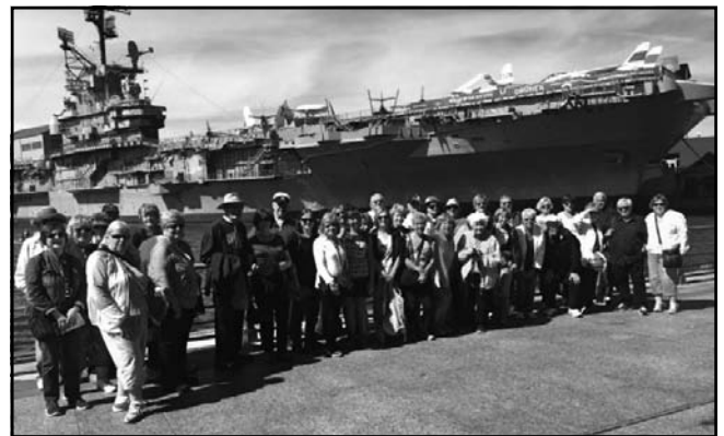
Ships and fire engines in New York, oh my!