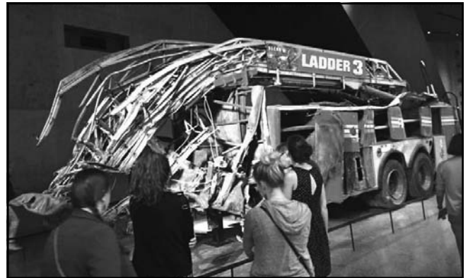
Ladder 3 Fire Engine after 9/11 World Trade Center Attack.