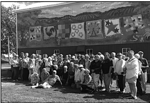
Members saw wonderful barn quilts on their tour.