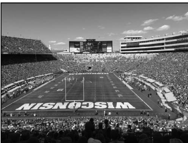
A great view of the Wisconsin Badgers vs Owls football game.