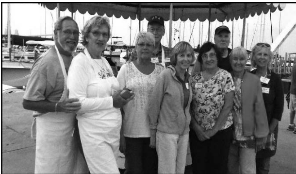
There are never too many cooks in the kitchen on the annual Vagabond sailing night.