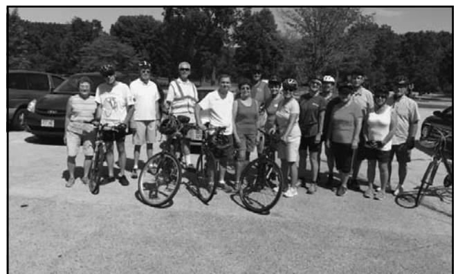
Whitnall Park provided a great bike ride for our members at the Labor Day Picnic.