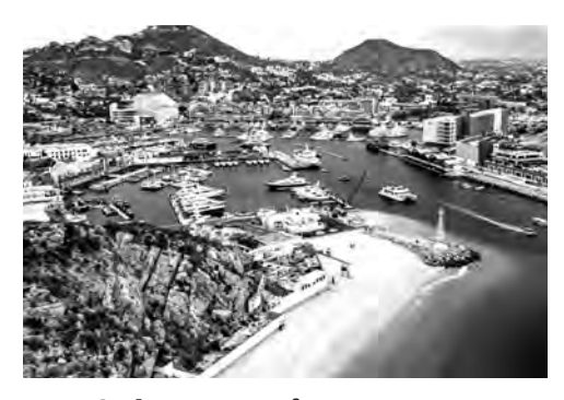
Los Cabos, Mexico Feb. 18-25 Wait list available

Sign up online (wait list only) or call Sue at (414) 421-6248 for details. Total price is $2,032 per person , double occupancy with ocean view.