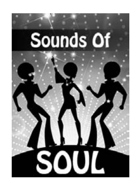
Sounds of Soul Tues., March 5 2 pm Sunset Playhouse 700 Wall Street, Elm Grove

Cost is $7. See payment options at the beginning of this section. Questions? Contact Event Leader, Gerry Botticchio , W124 S6488 Hawthorne Rd., Muskego, 53150, #414-425-3911.