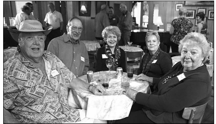
Vagabonds had another fun time in Door County.