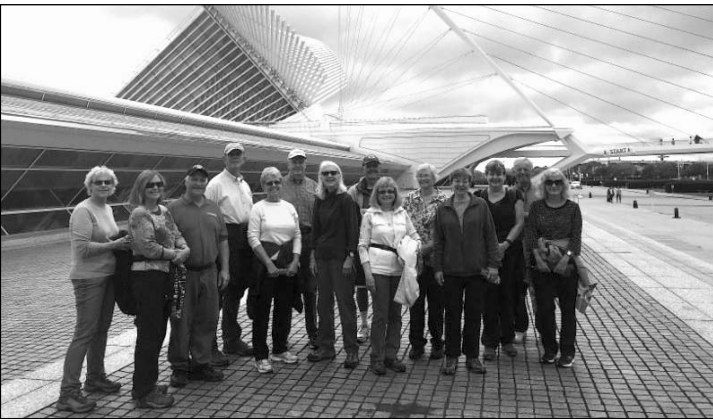
Our first hike of the season at the lakefront.