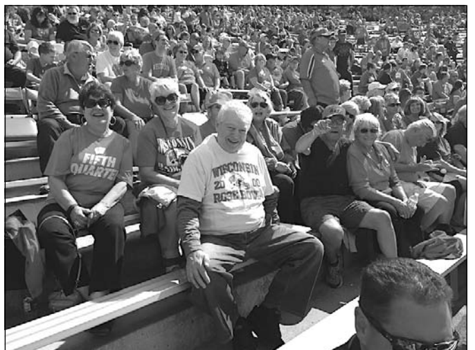
Vagabonds enjoy a beautiful watching the Badger game.