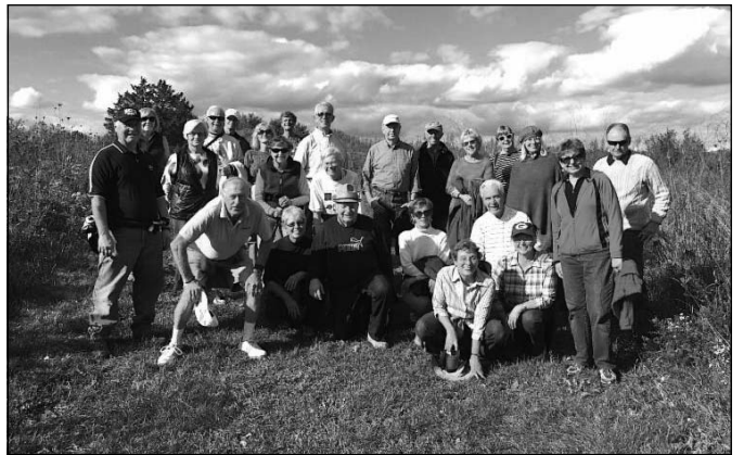
Our Nashotah hikers.